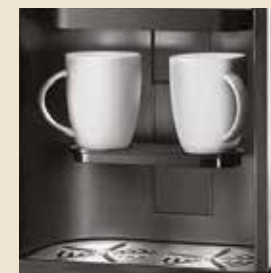
Separate delivery points: Coffee, chocolate, and mixed drinks on the left, and water on the right. This prevents any cross contamination into the water.