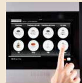
The 10" touch screen - 1280 x 800 - offers a visual guide, making choices easy. The design and layout of the screen can also be fully customized to suit any environment.