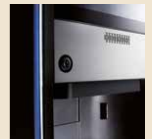
LED lights frame the cup area which enhance the overall visual appearance and user experience.