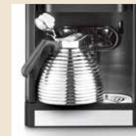
The spacious delivery area with adjustable cup holders allows you to fill coffee pots or thermo jugs.