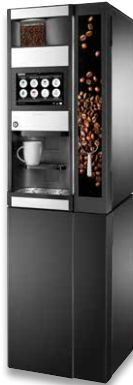
The elegant base stand enhances the design of the machine.

Evoca S.p.A. reserves the right to alter specifications without prior notice