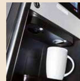
A light path in the cup area helps ensure that the cup is placed in the correct position. Cup sensors recognize cups or mugs made from a variety of different material including paper, plastic, glass and porcelain.