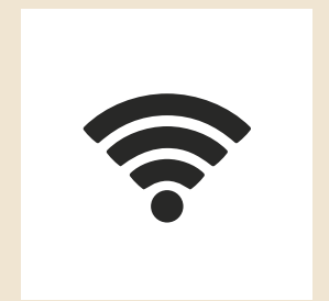
WiFi and Bluetooth enabled on-screen information and entertainment.